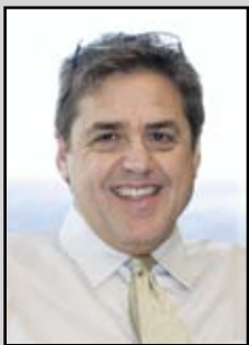
withers Bergman LLP

Shipman & Goodwin LLP is a full-service law firm representing many of the leading businesses, institutions, individuals, and government entities in Connecticut and throughout the New England and Mid-Atlantic regions. With approximately 150 attorneys practicing from offices throughout Connecticut, the firm is recognized for its depth of knowledge and experience in a number of industry sectors including labor and employment, education, government, banking and financial services, health care, non-profit organizations, emerging and middle-market companies, real estate development, energy, telecommunications, antitrust and trade regulation, franchising, retail, software and IT. For more information, visit www.shipmangoodwin.com .