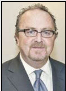
HinckleyAllenSnyder LLP ATTORNEYS AT LAW

Withers Bergman LLP provides a full range of corporate legal services to our clients including: M&A, corporate finance, joint ventures and partnerships, corporate tax, corporate governance, securities transactions, executive compensation, commercial litigation, and real estate. With a solid understanding of our client's business and goals, our lawyers rely on their legal and business acumen to provide strategic legal advice. With seven offices worldwide, we serve global clients in their time zone, using their native language to explain and handle the requirements of multiple jurisdictions. Please visit www.withersworldwide.com for more information about our firm.