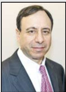
SHIPMAN & GOODWIN LLP COUNSELORS AT LAW

Day Pitney LLP is a full-service law firm with approximately 400 attorneys operating in offices in New York, New Jersey, Connecticut, Boston, and Washington, DC. With a focus on client service, Day Pitney offers clients deep capabilities in areas such as government investigations, labor, employment, employee benefits, trusts and estates, mergers and acquisitions, international estate planning, business bankruptcy and financial restructuring, energy law, and intellectual property prosecution and litigation. The firm's individual clients department offers 100-plus years of experience advising individuals and their families.