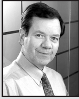
Hinckley Allen & Snyder LLP

The current market conditions present an ideal opportunity for buyers to carefully consider the provisions in a purchase and sale agreement for the acquisition of development real estate. Given the challenging market, the dynamic between buyers and sellers is in a state of transition.